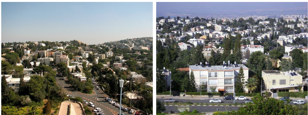
Figure 2 - Similar vegetation in Ahuza (left) and Neve-Shaanan (right)

In terms of socio-economic level, the CBS socio-economic index rating of the two neighbourhoods is similar: 7 in Neve-Shaanan and 8 in Ahuza on a 10-points national scale (CBS, 1995). In terms of shopping and leisure opportunities, although the Ahuza neighbourhood offers more shopping opportunities along its main street, both neighbourhoods are located within very short driving distance from nearby large and relatively new shopping malls, hosting a variety of shops, restaurants and coffee shops, cinemas and gyms. In terms of location and view, both neighbourhoods are located on the top of the Carmel Mountain and both neighbourhoods include properties without a view as well as properties looking at either the green Carmel mountain slopes or the Mediterranean sea of Haifa bay. The two neighbourhoods are also similar in terms of vegetation as demonstrated in Figure 2.