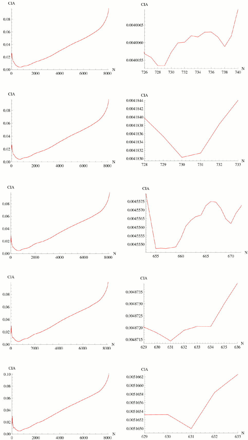
Figure 1: AIC values for Spain 1998, 2001, 2003, 2005 and 2007 (on the left all the values of AIC , on the right the values of AIC next to the optimal truncation point)