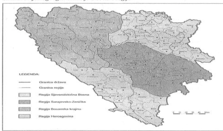
Figure 3.- Proposal of B&H regionalization in four regions Slika 2. Prijedlog regionalizacije BiH na 4 regije

Regionalization of Bosnia and Herzegovina to the European requirements is not yet even begun. It seems that representatives of all three constituent peoples who live here have a different opinion today. It is important to emphasize that the current administrative structure of the B&H, entities and cantons, is not appropriate to modern European standards of regionalization according to the NUTS system. One of opinions about regionalism in B&H can be seen in the following figure: