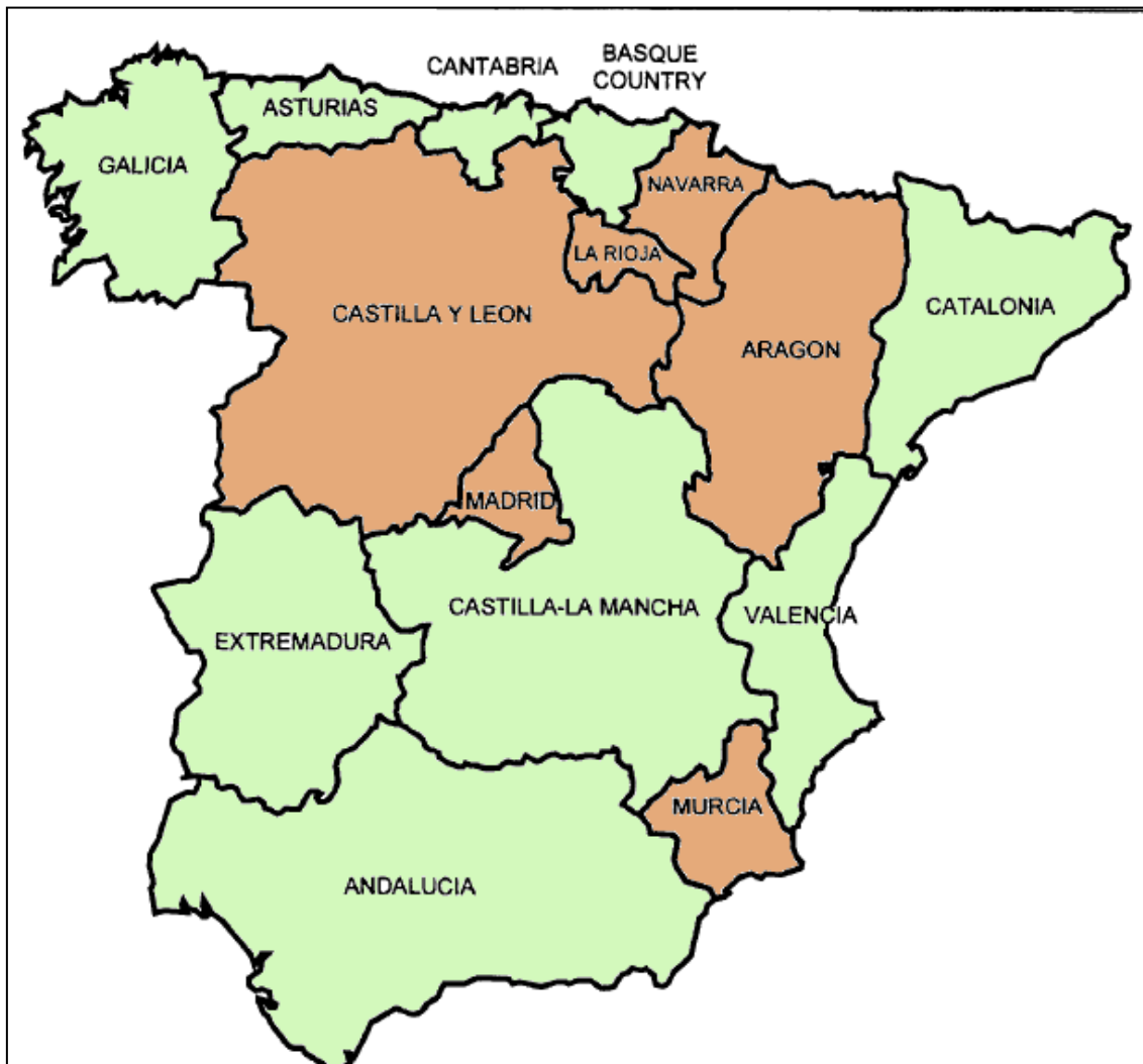
Map 1. Net re-allocation on spatial weights by region