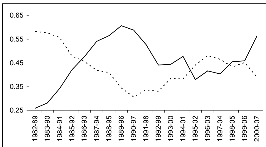
Figure 1: Rolling Moran coefficient

Note: Average Moran coefficient for first order spatial autocorrelation between EU (continuous line) and US (dashed line) regions.