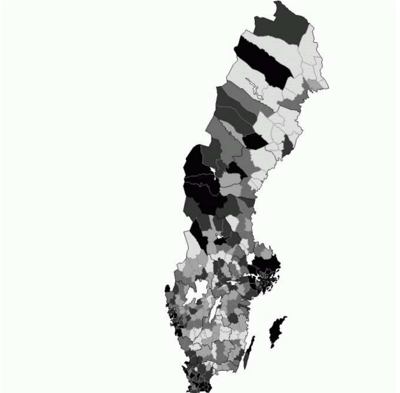
Figure 1. Concentration of economic entrepreneurship (start-ups/capita) in Swedish municipalities