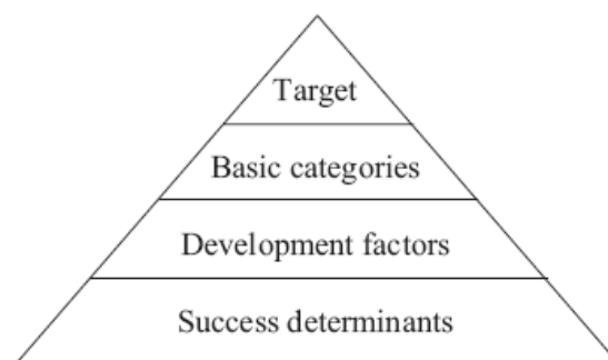
Figure 1. The pyramid model

There has been intense and increasing discussion on the conceptualisation of regional/territorial competitiveness and about the issue of the appropriateness of the term itself (for instance, Krugman, 1994 and Camagni, 2002). Although theorising about territorial competitiveness is problematic this expression is broadly conceptualised in terms of three aspects: 1) the ability of regions to attract and maintain investment; 2) their capability to insert successfully in international markets as exporters; and 3) their ability to maintain high and sustainable living standards for their population. Increasing productivity –understood as the productive efficiency of factors of production- as well as economic growth and low unemployment are among the most employed measures of revealed competitiveness. A parallel discussion deals with the sources or factors of competitiveness. A comprehensive and schematic view of competitiveness and its components is the pyramid model (figure 1) which in three levels distinguishes between the Basic categories or ex post indicators and measures of competitiveness; Programming factors or ex ante factors improving competitiveness with an immediate impact on basic categories; and Success determinants which are conditions with an indirect impact on basic categories because they take shape over a longer period of time - they are necessary conditions for competitiveness and thus are at the bottom of the pyramid (Lengyel, 2004).