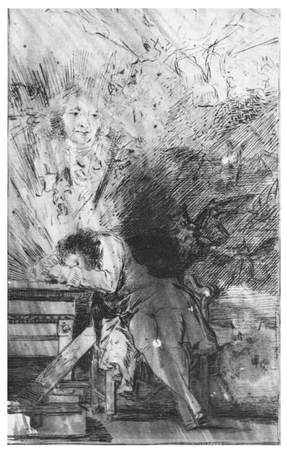
monsters". Francisco Goya, 1797.

Now, occult belief systems, like religions in general, induce not just a certain vision of the world and of human relations, but they also provide, as shown above, for strong emotions. This relates not just to individual hate, fear, or other emotions directly linked Fig. 1: "The dream [sleep] of reason produces to witchcraft, but to the whole fabric of the