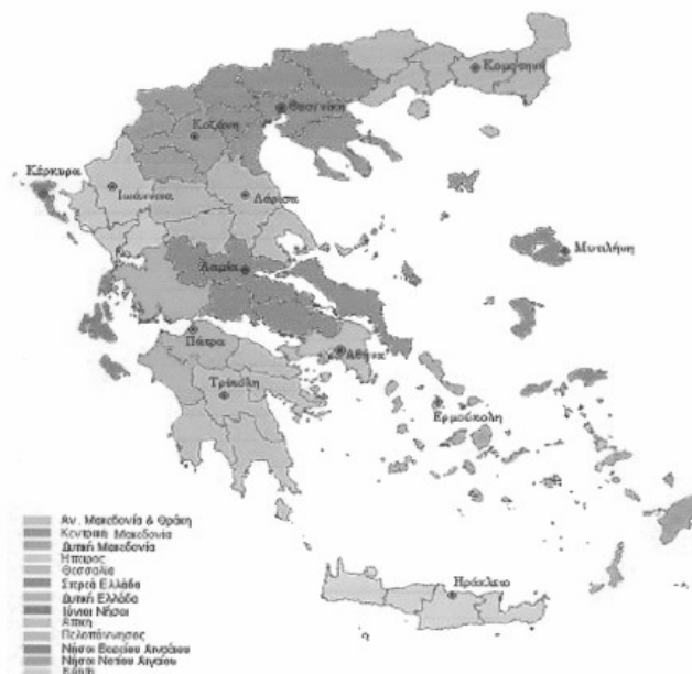
Map 1. Administrative Regions of the Greek Territory – Current Situation:

[ 1] Eastern Macedonia and Thrace, [2] Central Macedonia, [3] Western Macedonia, [4] Epirus, [5] Thessaly, [6] Central Greece, [7] Western Greece, [8] Ionian Islands, [9] Peloponnese, [10] Attiki, [11] Islands of the Northern Aegean, [ 12] Islands of the Southern Aegean, [ 13] Island of Crete.