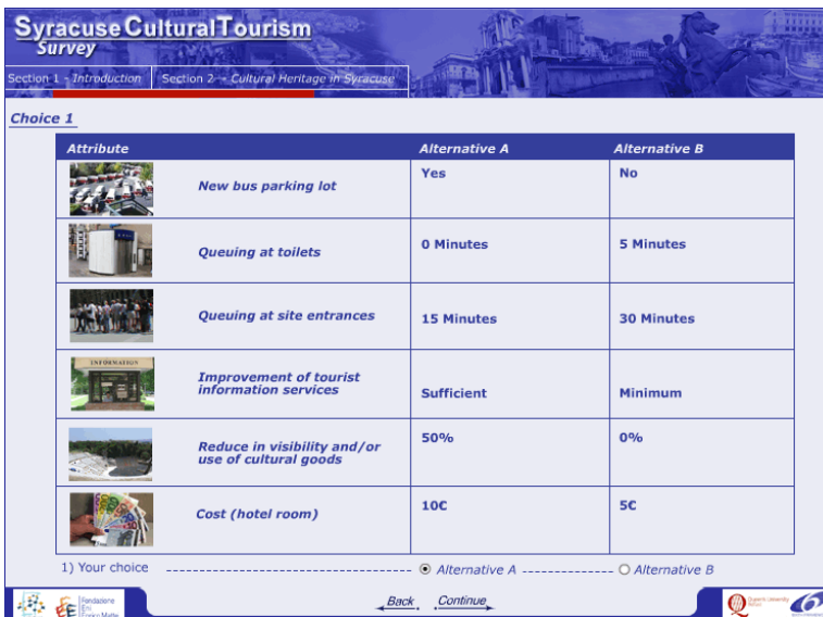
Fig 5 : Example of Tourist's choice

Potential respondents who fit the sample criteria and consent to participate are first asked a series of questions related to their opinions about tourism and their level of participation in cultural heritage preservation activities. This helps to distinguish between those who are actively engaged in cultural heritage preservation and those with an affinity towards cultural heritage and those who are not culturally inclined.