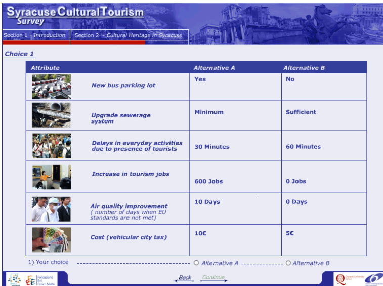
Fig 4 : Example of Resident's choice