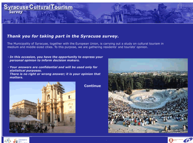
Fig 3: Welcome screen

tourists' experience. Most tourists complained for the lack of dedicated parking slots, for the lack of services, of signage and the long queues for toilets or to enter some sites at certain times. They also expressed disappointment in having the entrance to sites restricted for different reasons. Some complained for the presence of rubbish, but very few seemed concerned with the physical preservation of the site. Most tourists would come to Syracuse in groups, and spend relatively little time in the city, with consequences on the economic benefits to the city. However, the increase and improvement in the hotel rooms offer, especially bed and breakfast type, seemed to have transformed in recent years day trippers in more residential tourists.