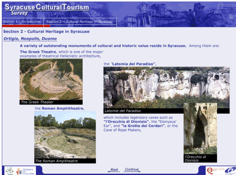
Fig 2: Cultural Heritage in Syracuse

in the tourism literature over the past 30 years. Generally speaking, these studies focus on tourist preferences and behavior related to the destination selection as well as the tourism experience and together they provide a framework on which the use of conjoint analysis to evaluate tourist-related choice behavior is based also in our case study. In fact, the mentioned literature served as a baseline to develop the research scenario for the city of Syracuse's conjoint analysis application.