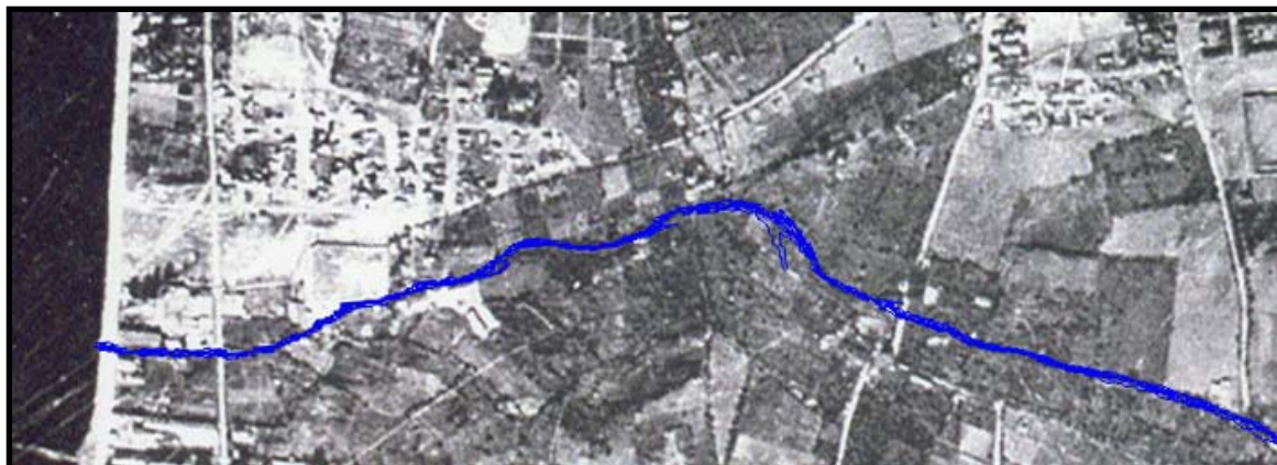
Figure 1: The Riverside Zone of the River Diakoniaris, from an aerial photograph of 1931

Up to the beginning of '30s (figure 1), the Diakoniaris was bordered solely by fields and a great percentage of it was intact in its natural form, its riverbed undefined, with marshes and other natural elements in the wider region of the river. The land bordering on the river was cultivable. Moreover, it is believed that the river also fed irrigation canals.