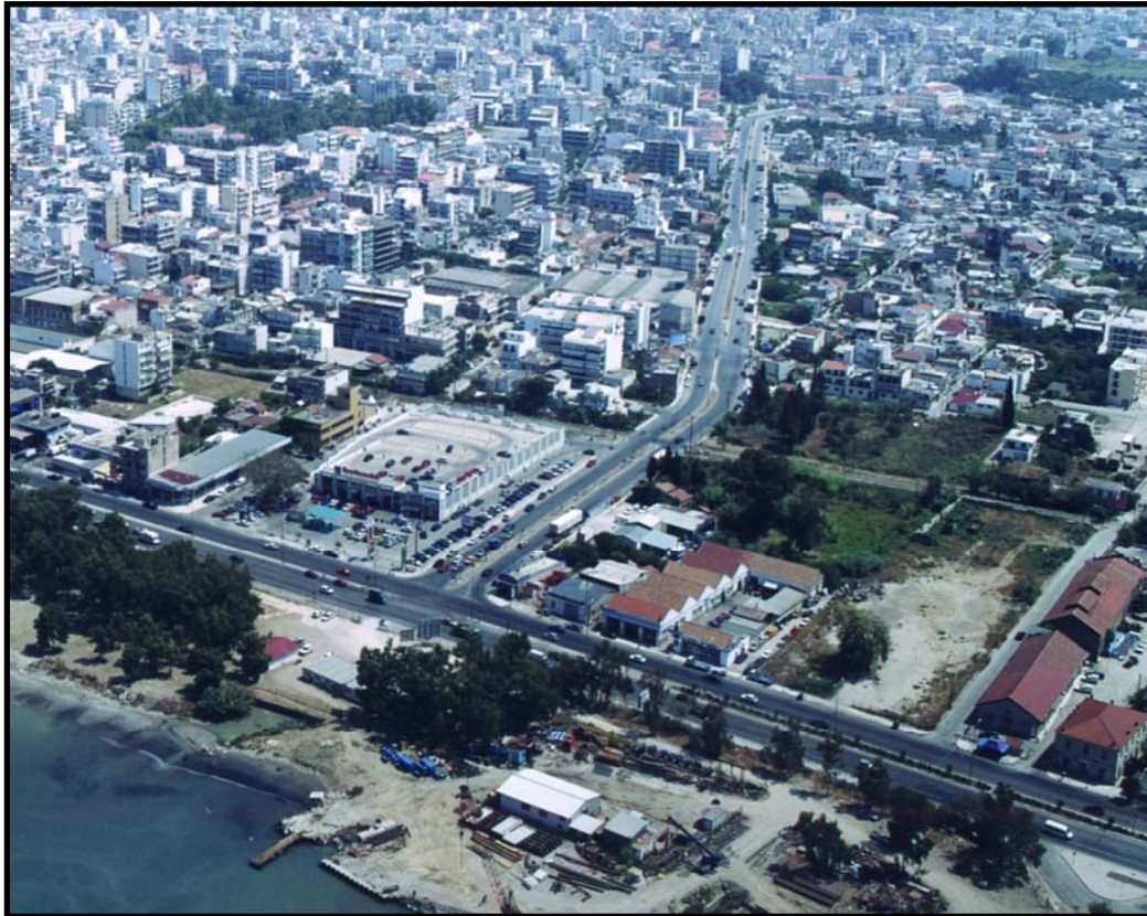
Figure 4: View of E.Venizelos St. from the estuary.

The part of the River Diakoniaris (from the 5 th km up to the 10 th km), reflects the typical development of a peripheral Greek urban area and is characterized from the presence of small settlements with low residential density, mixes pointed land uses such as housing, farmlands, sheepfolds, e and a simple nature with some forests but not specific habitats. The networks of roads mark poor assess from one place to another. For these areas there is no specific land use regulation and the construction activities follow the built up principles of “outside the City Plan limits area”, that leads at least to an “anarchic” land usage.