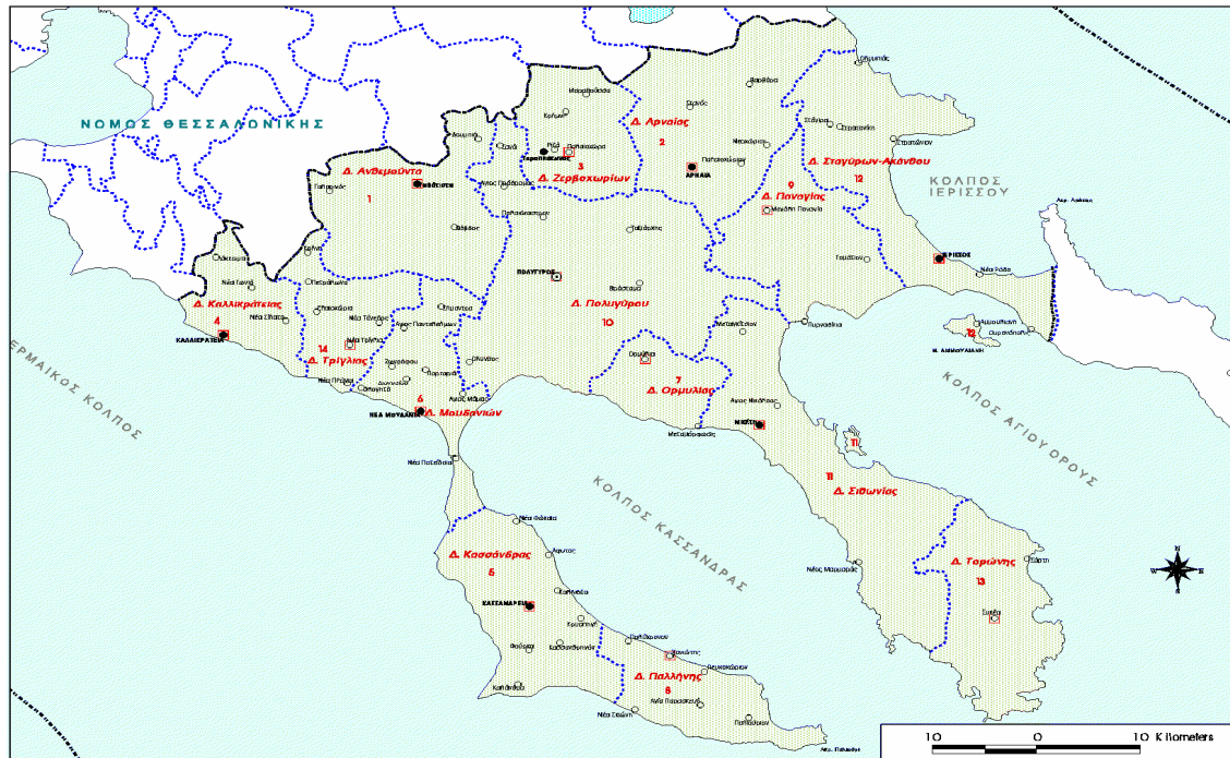
MAP 1. Chalkidiki peninsula and his municipal apartments.

WCED (1987) Our Common Future . Report of the World Commission on Environment and Development (The Brundtland Commission). Oxford University Press, Oxford.