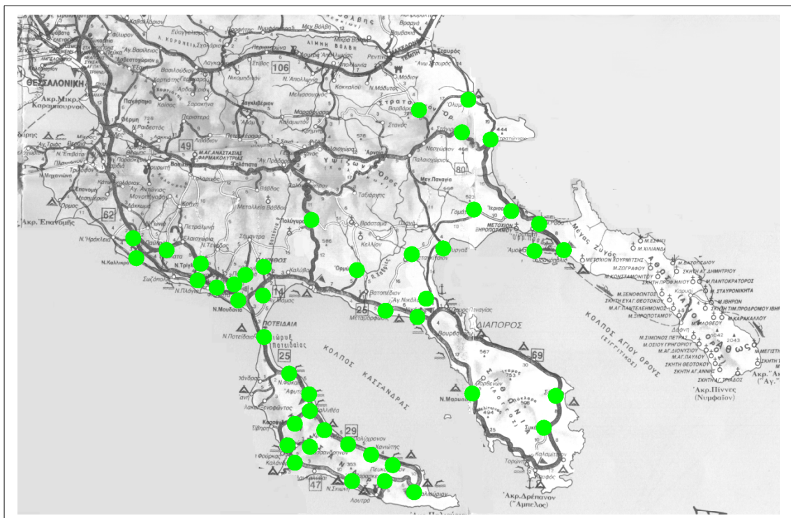
MAP 2. Municipalities/Municipal Apartments of Chalkidiki peninsula (Case study)