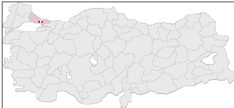
Figure 1: Map of Turkey and Istanbul