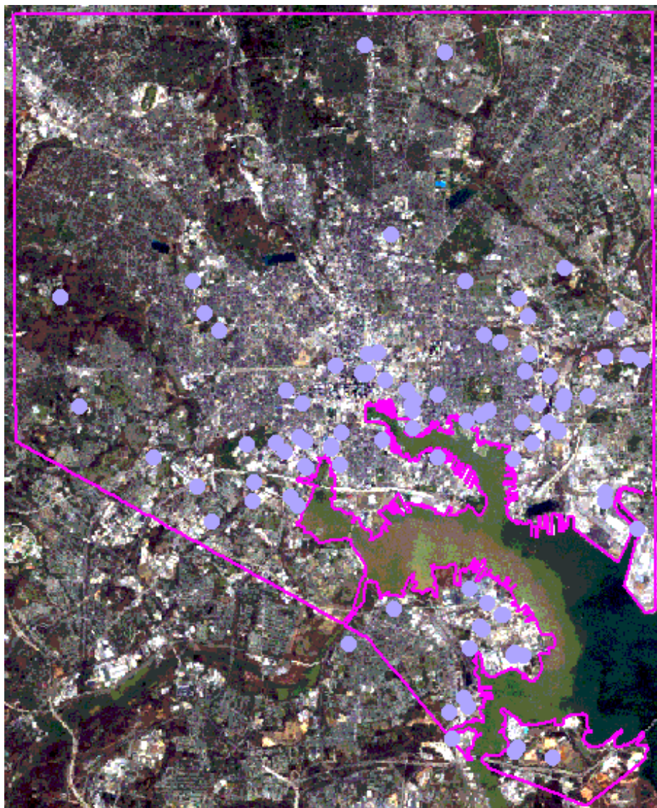
Figure 2. Contaminated and potentially contaminated sites in Baltimore City