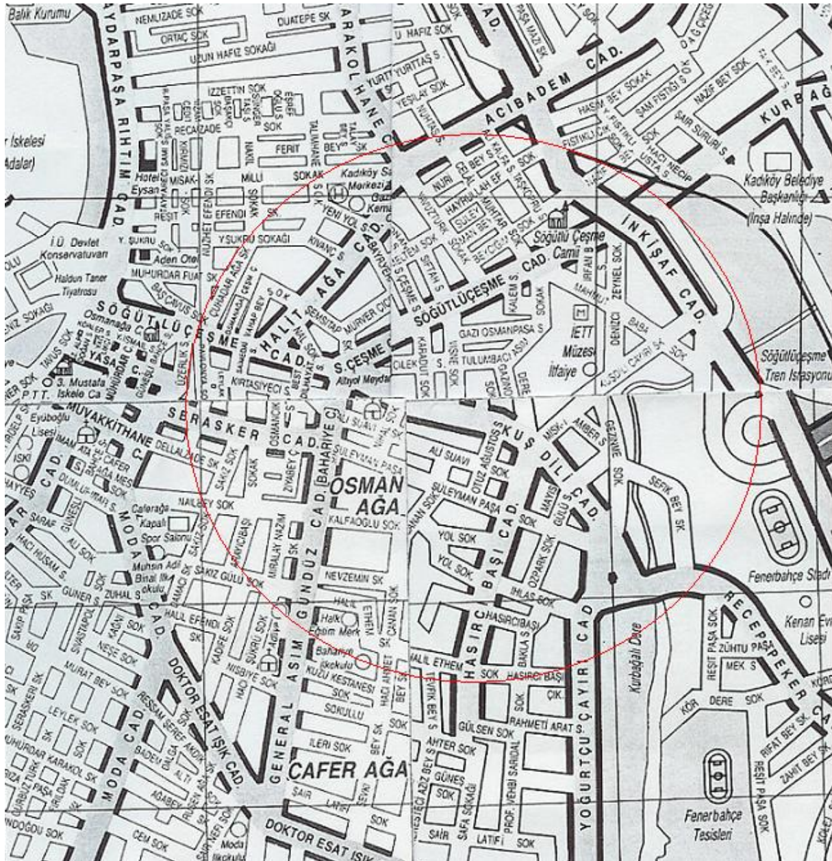
Figure 2 Tuesday Market (Salı Pazarı) Kadıköy and its impact on the immediate environment