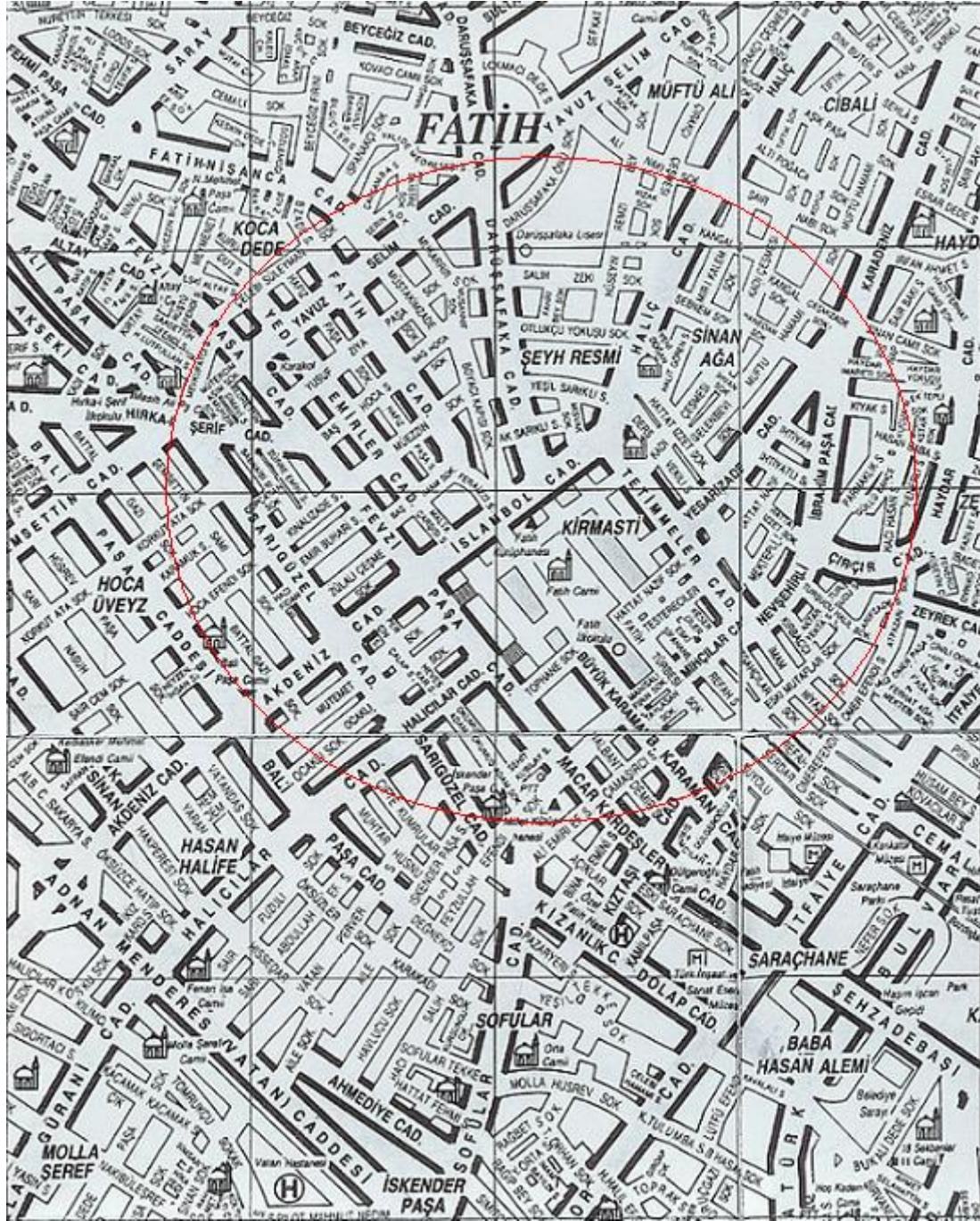
Figure 3 Wednesday Market (Çarşamba Pazarı) Fatih and its impact on the immediate environment