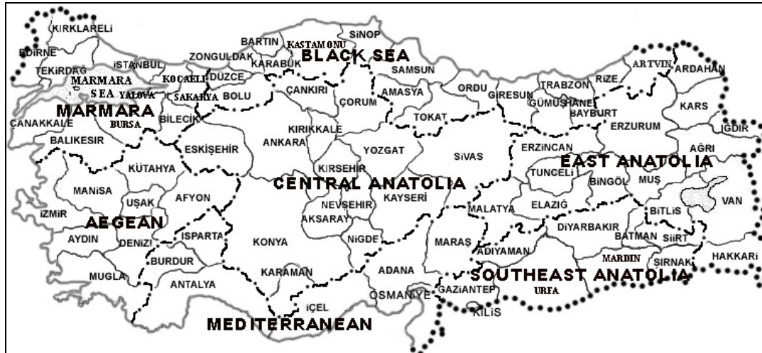
Figure 1: Map of the Regions of Turkey

sub-district and villages. This matter creates a limitation on the study and migration involves from/to each province as an aggregate data. This limitation is pointed out in Gedik's (1996) study too.