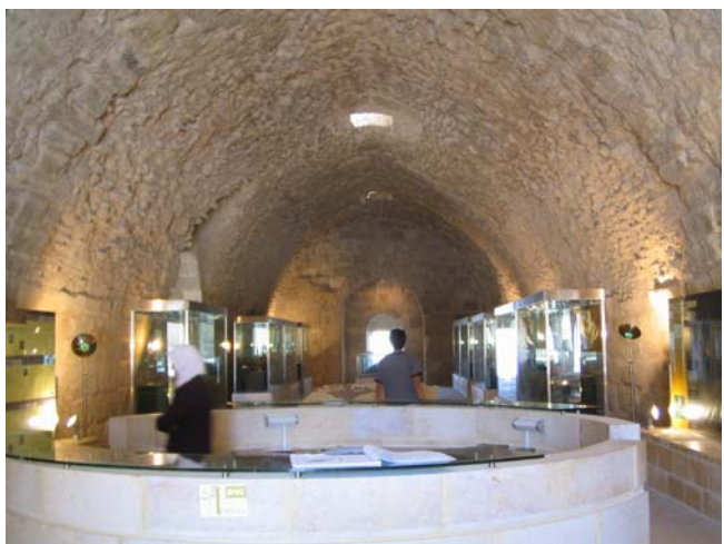
Picture 2. Karak Archaeological Museum