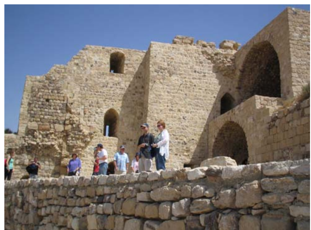
Picture 9. Karak castle