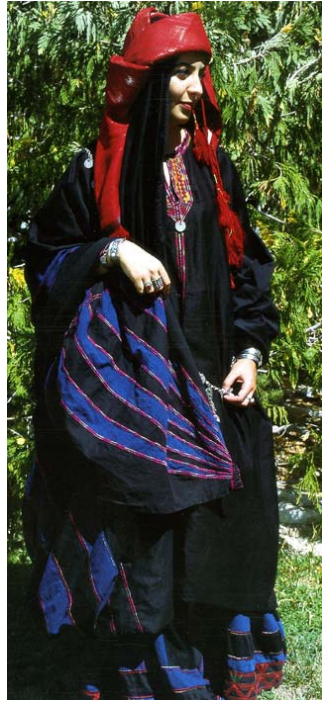
Picture 6. The largest dress in the world

(Picture 4). Although the national Antique Law only targets the remains before 1750, the Salt city originally designates about ten buildings for the preservation and placed a plate on the wall (Picture 5).