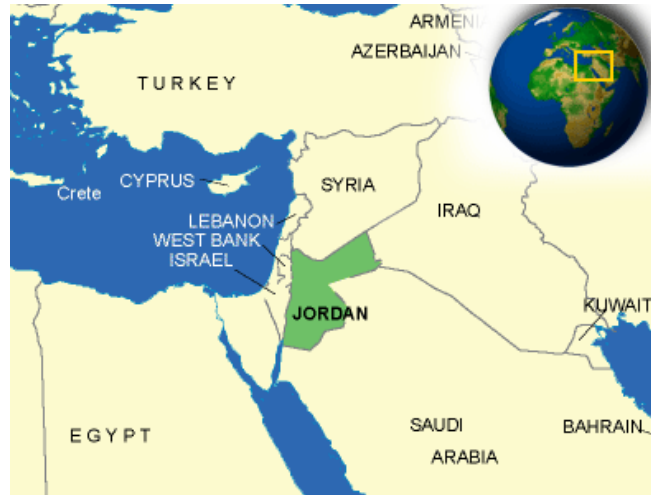
Figure 1. Location of Jordan

and socio-culture. Tourist spending such as accommodation, transportation, food and beverage, and shopping are direct revenue for the region. Furthermore, employment and raw material supply needs can be generated as ripple effects. Facilitation of infrastructure including construction of road, water supply and sewage treatment facilities, waste management plants, and leisure facilities serves for both tourists and residents. Socio-cultural impact is human interaction with people who have different history, culture, and social background. It may enhance the understandings different cultures and prevent conflicts between them. Therefore, the tourism development is perceived as a useful measure for regional development. Meanwhile, negative impacts are noted as decline of natural environment, socio-cultural values, and increase of crime 2 .