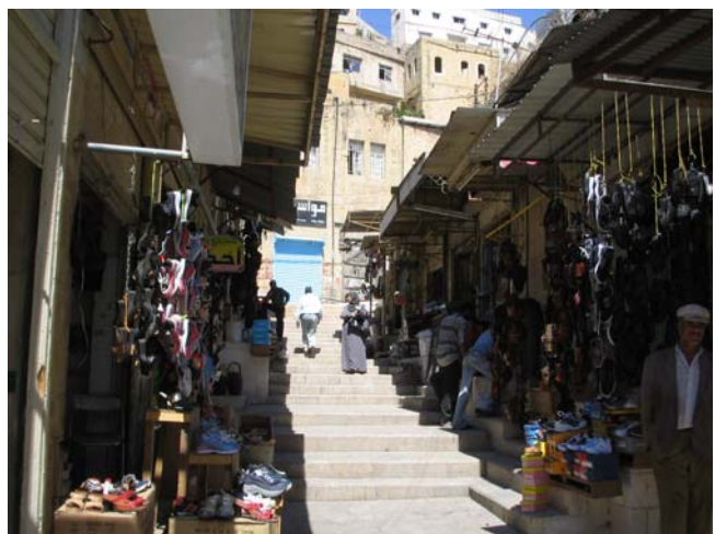
Picture 7. Paved Market Street