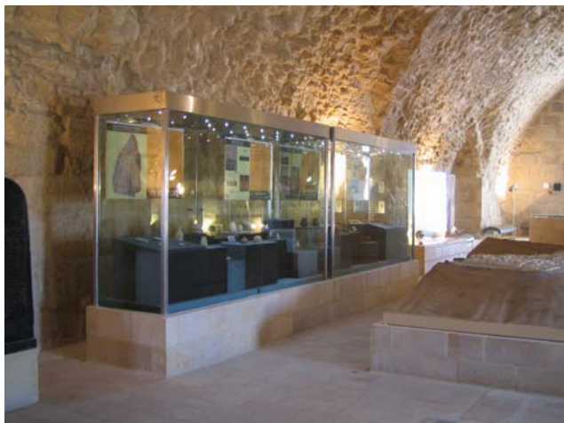
Picture 10. Exhibition of Archeological Museum

Moreover, the operation and maintenance plans of the existing resources such as castle and museum must be formed especially considering financial point of view. Whether or not they can manage the maintenance costs and operational costs including personnel expenses by collecting admission fee or governmental subsidies should be determined. The sustainability of Ministry’s commitment shall be examined too.