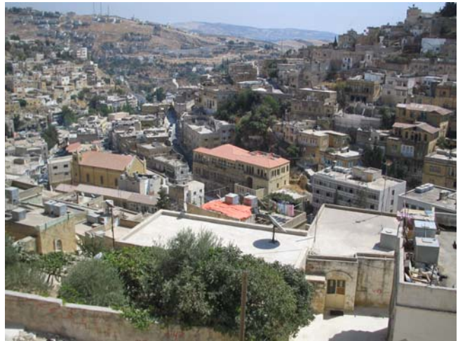
Picture 4. View of Salt city

There is an academic institution named Al-Balqa Applied University in Salt. The university was established in 1997 with 16 colleges for two years courses in different location in Jordan. Its objectives are not only to provide educational opportunity for younger generation but to cooperate with local community.