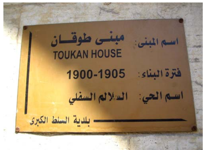
Picture 5. A Sign for the designated historical building