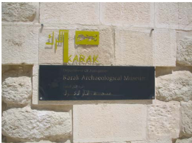
Picture 11. Sign board with Lion