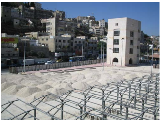
Picture 3. Raghadan Bus Terminal construction site