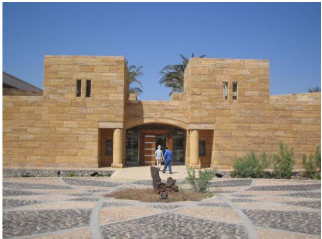
Picture 1. Dead Sea Museum

According to the Jordan National Tourism Strategy 2004-2010, the vision of tourism is stated as "Tourism is an essential and vibrant growth sector that will contribute to improving the long-term