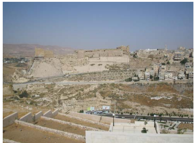
Picture 8. Overview of Karak from observation deck

JBIC carried out several Yen Loan projects including two observation decks, renovation of Karak Archeological Museum (locates inside of the castle), facilitation of visitor center, and pavement. World Bank (WB) is funding the restoration of castle outer walls. JICA provides long-term specialists for the coordination of museum exhibition and the capacity building of museum staff (Picture 10). Currently, the museum is under operation by two curators from Karak who belong to the Ministry of Tourism and