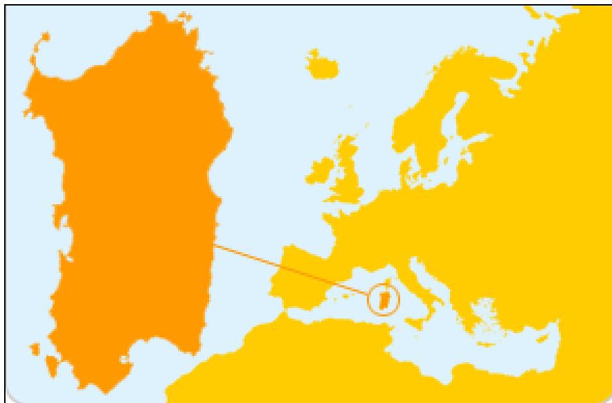
Figure 1. A Map of Sardinia

In economics terms, Sardinia gross domestic product per head is lower with respect to the Italian regions located in the Centre-North (in the last years the divergence has increased) and higher with respect to the average of the Italian Mezzogiorno 2 . Two third of the regional value added is produced mainly by the service sector, around 20% by industry, and 4% by agriculture. As far as employment is concerned, labour force in the service sector has increased in ten years (from 65% in 1994 to 69% in 2004), while agriculture has diminished at 6% (from 11% of 1994; Meloni et al. 2006). The rate of unemployment is 13% (14% in the Mezzogiorno). Sardinia can be regarded as a ‘sea and sun’ tourist destination characterised by a high seasonality in summer with the peak in August. It implies a hotels rate of utilisation that equals to an annual average of 23%. As a consequence, local workers experience an uneven income. From an economic point of view tourism is the most relevant export industry (Paci 1999). According to Touring Club Italiano (2004), tourism expenditure in Sardinia in 2002