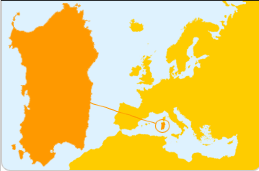
Figure 1. A Map of Sardinia

In economics terms, Sardinia gross domestic product per head is lower with respect to the Italian regions located in the Centre-North (in the last years the divergence has increased) and higher with respect to the average of the Italian Mezzogiorno 2 . Two third of the regional value added is produced mainly by the service sector, around 20% by industry, and 4% by agriculture. As far as employment is concerned, labour force in the service sector has increased in ten years (from 65% in 1994 to 69% in 2004), while agriculture has diminished at 6% (from 11% of 1994; Meloni et al. 2006). The rate of unemployment is 13% (14% in the Mezzogiorno). Sardinia can be regarded as a ‘sea and sun’ tourist destination characterised by a high seasonality in summer with the peak in August. It implies a hotels rate of utilisation that equals to an annual average of 23%. As a consequence, local workers experience an uneven income. From an economic point of view tourism is the most relevant export industry (Paci 1999). According to Touring Club Italiano (2004), tourism expenditure in Sardinia in 2002