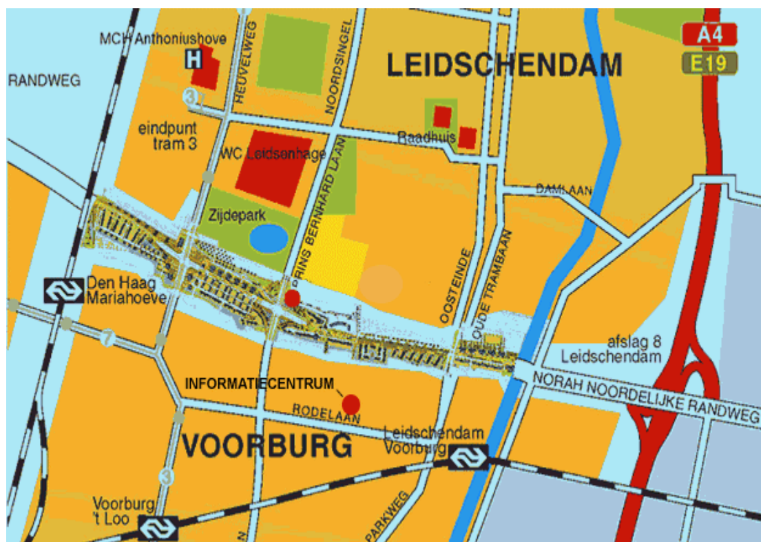
Figure site overview of the “Verlengde Landscheidingsweg

The conflict between the Ministry of Transport and the local authority reached its climax late in May 1988. The minister increased the pressure on Voorburg, threatening to punish any stubbornness on their part by having the provincial