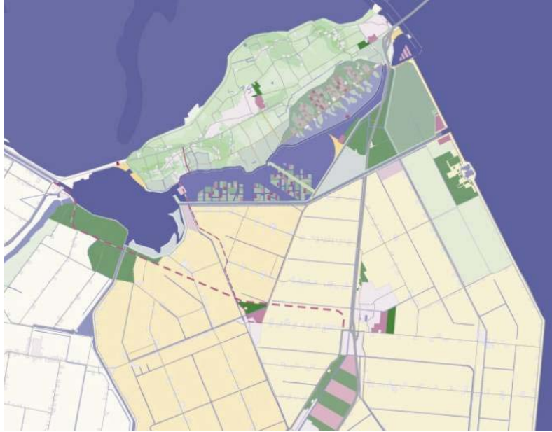
Figure 3. Plan submitted by 'Lago Wirense'

In December 2004, the process came to a temporary halt when the municipal council of Wieringen expressed their disagreement. Provincial and Municipal Executives had already approved the declaration of intent. A majority of the council opposed the extent and distribution of the financial risks, and they wanted more participation in the draft plan (PNH, 2004). The steering committee replied with a proposal to reduce financial risks and to engage in a concentrated interactive elaboration period of a month. Members of the provincial executives and councils together laid down an understanding of the coming deliberations. A few weeks with intensive dialogue between all parties involved followed. Some functional and financial details were changed, after which a considerable political support towards the declaration of intent emerged. The project followed with a move in the summer of 2005 towards establishing a further declaration of collaboration.