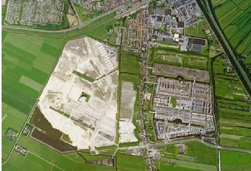
Photo 1: At the right Saendelft Saendelft-East; left Saendelft-West.

action. In addition, we will look through the same strategic glasses, using various policy documents (Zaanstad, 2005; HHNK, 2005) that reflect recent attempts by the municipality of Zaanstad and water board ‘Northern Quarter of Holland’ (Hoogheemraadschap Hollands Noorderkwartier 1 ) to build closer links between water and space.