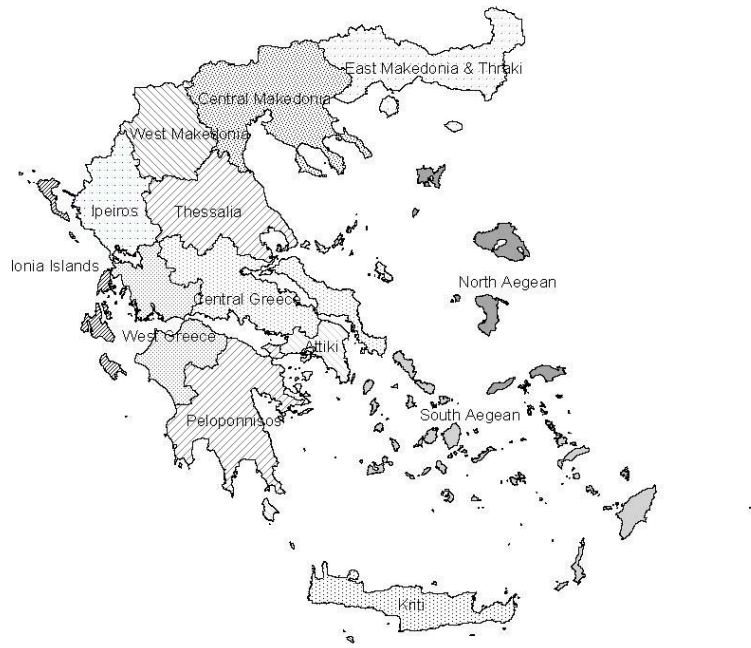
Figure 1. Greek regions