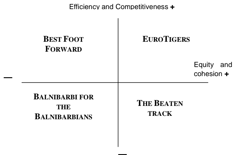
Figure 1 Scenario overview

Bearing in mind that the original idea behind the Lisbon strategy is economic growth rather than social cohesion and the environment, only two of the four economy scenarios will be worked out in detail, one where the “back to basics” approach described in the midterm review is dominant (best foot forward), and one which strives for growth in the context of “territorial cohesion” as understood in the ESDP (EuroTigers). 3 The presentation includes a short recap of the motivation behind the scenario, the political context, and the