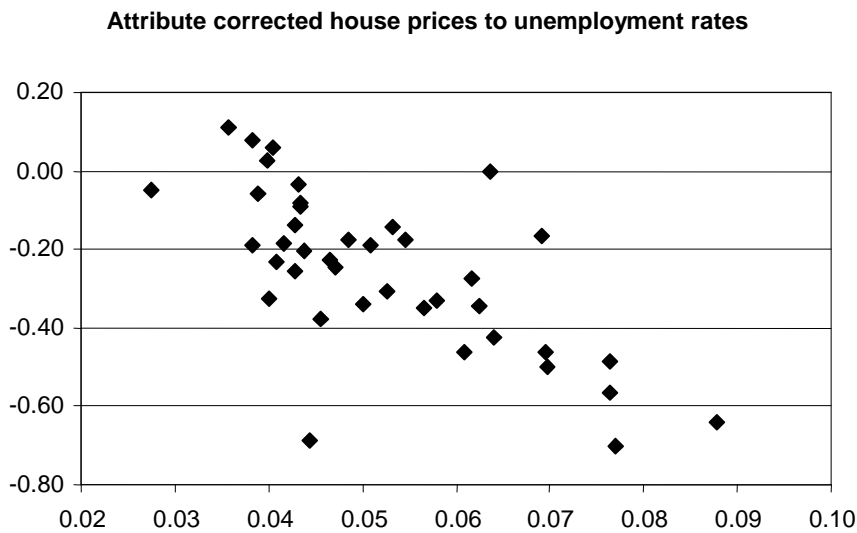
Figure 2: attribute-corrected regional house prices (in logarithms) to unemployment rates, Amsterdam is reference region

Using the total sample of households, we are able to make a finer regional division of the Netherlands. With an increased number of degrees of freedom, the negative relationship between regional unemployment and house prices is re-established. The figures 2 and 3 show scatterplots of attribute-corrected regional house prices and rents to unemployment, where Amsterdam (the capital, situated in the West of the country) is the reference region.