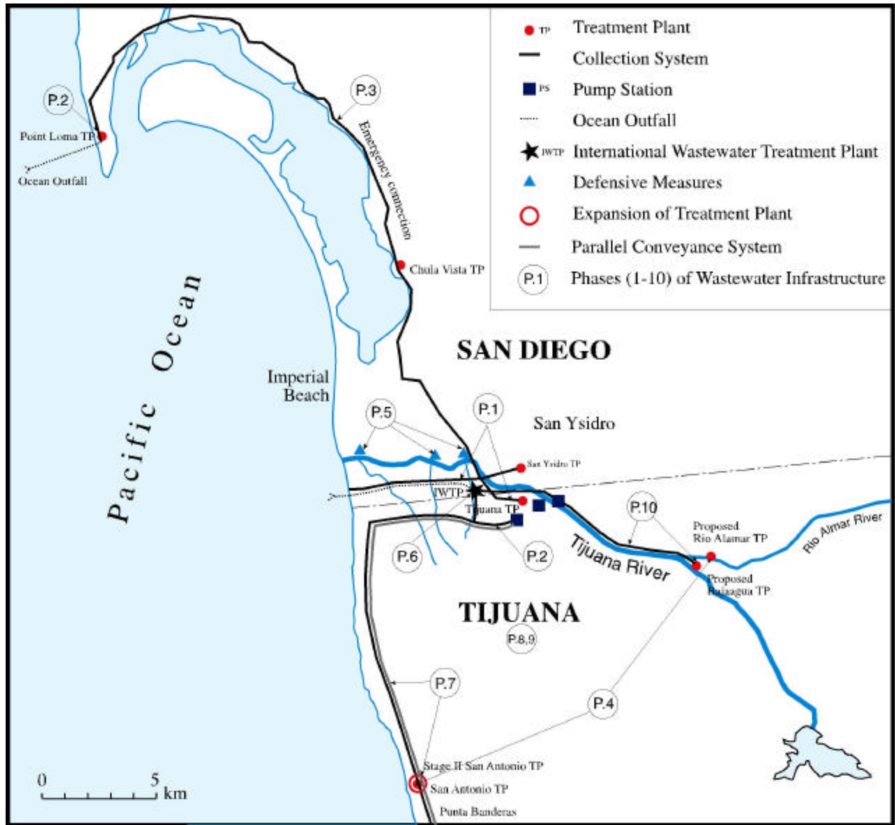
Figure 1: Location map and phases of wastewater infrastructure