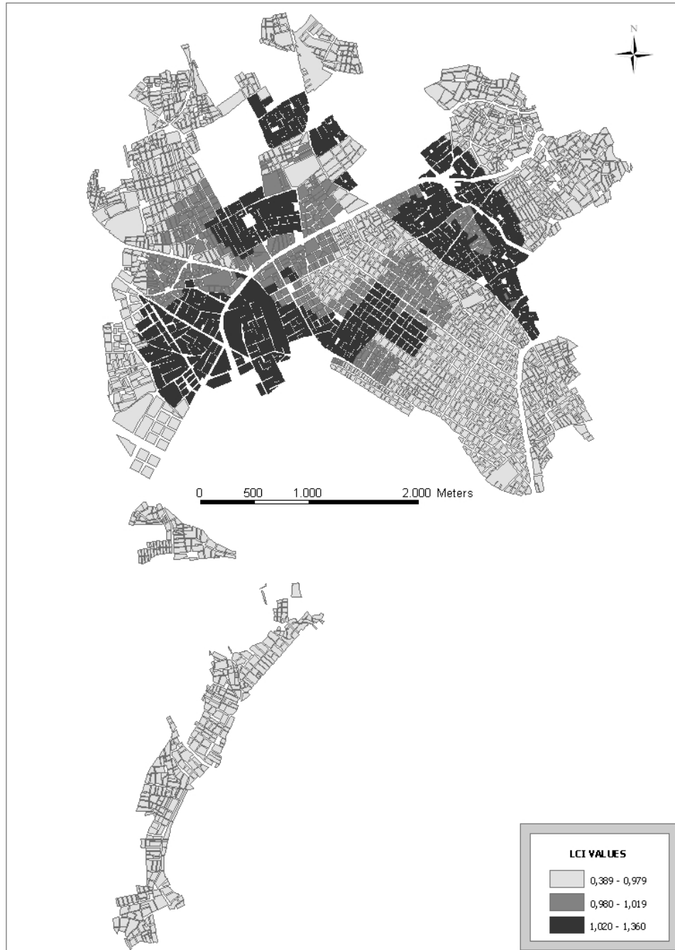
Figure 3. Locational Convergence Index per building block of the study area

The values of LCI are calculated for each building block of the study area which are then grouped depending whether its value is < 1 , \approx 1 or > 1 ( Figure 3 ).