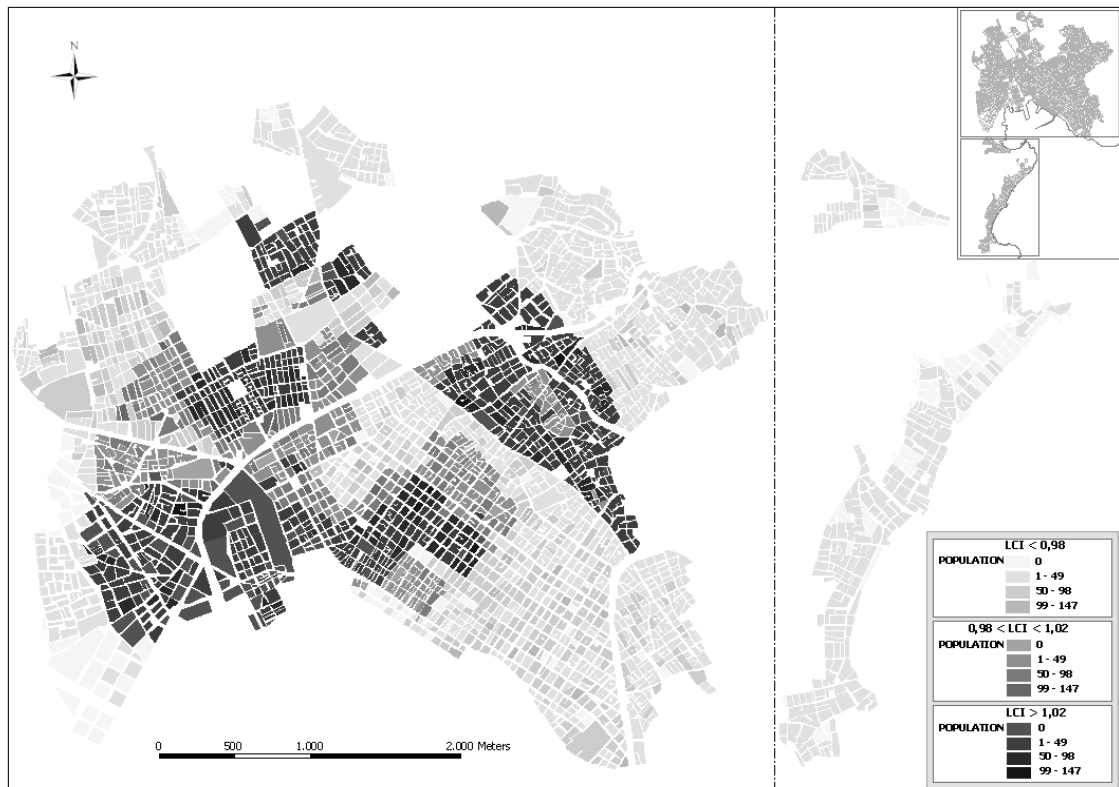
Figure 4. Locational Convergence Index and population per building block

Building blocks in the group with values < 0,98 (relative locational value smaller than the relative land value) are located in the wider part of the study area. The LCI values between 0,98 and 1,019 imply that the relative locational value is almost equal with the relative land value and appear in a small part of the city centre and partly in the periphery of the study area. Finally, blocks with values > 1,019 (relative locational value greater than their relative land value) are mainly located in the central and north-eastern department of the study area. In the map of Figure 4 LCI values are comparatively overlaid with population per building block in order to assist both the cartographic representation and the interpretation stage of the analysis. Accordingly, in Table 10 the percentages of building blocks for each combination of LCI values and population are shown.