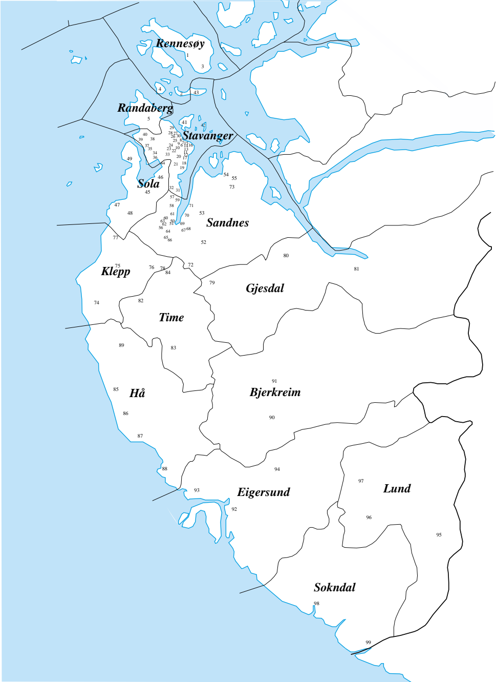
Figure 1: The division of the region into municipalities and zones