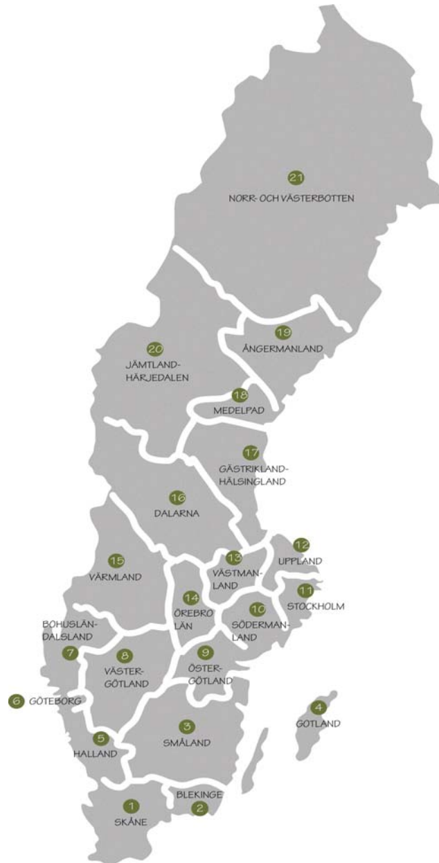
Figure 2: Golf districts in Sweden.