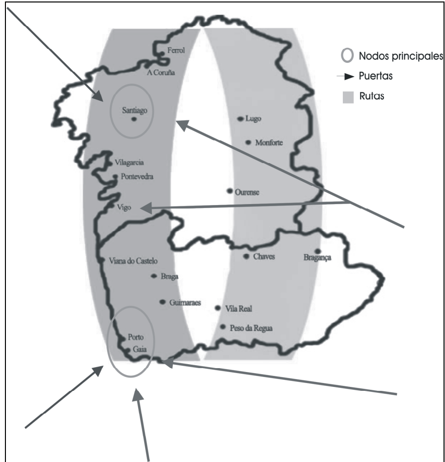
FIGURE 2. THE MODEL APPLIED TO THE EUROREGION