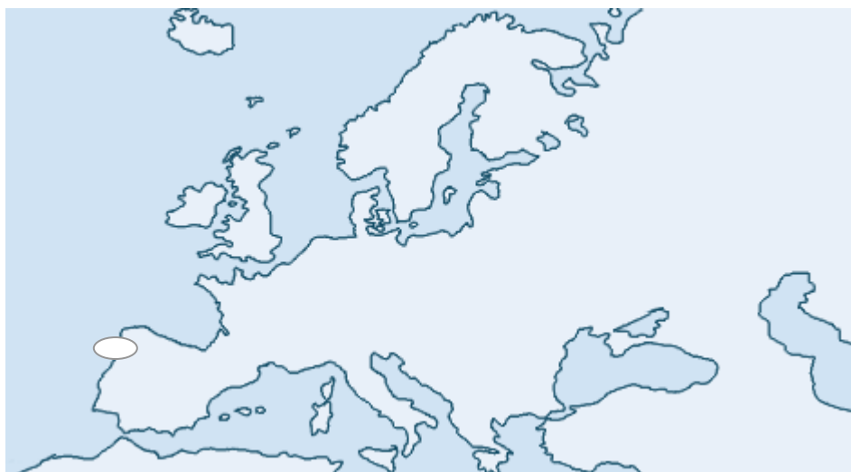
FIGURE 1. LOCATION OF THE AREA STUDIED

In official documents as well as in scientific literature it is still common today to find tourism described as a panacea and the solution to all the economic problems of regions and even countries, being solely responsible for adjusting balances of payments and generating movements of capital. Under this assumption, the traditional and expansive approach to tourist development is aimed at reducing barriers and stimulating market interest (Getz,1986). Everything centres on the economic benefits of the so-called tourist industry, especially those related to the generation of income, the creation of jobs and regional development.