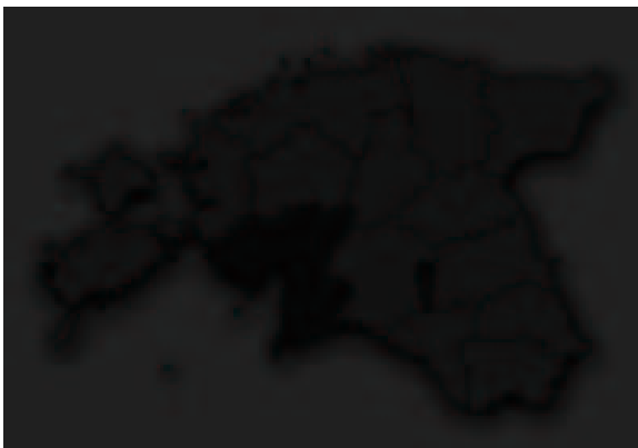
Figure 2. Location of Pärnu County

The most important push factor in tourism demand is Pärnu city, having an over 160-years history as a resort. The visitor's surveys in the last couple years are showing that the visitors of Pärnu city are a little bit tired of the static destination and they are pleased to broaden their travel experiences. The finest possibility would be to widen the tourism product to the county where there is a lot of unused tourism potential – cultural and natural attractions, interesting people and beautiful scenery.