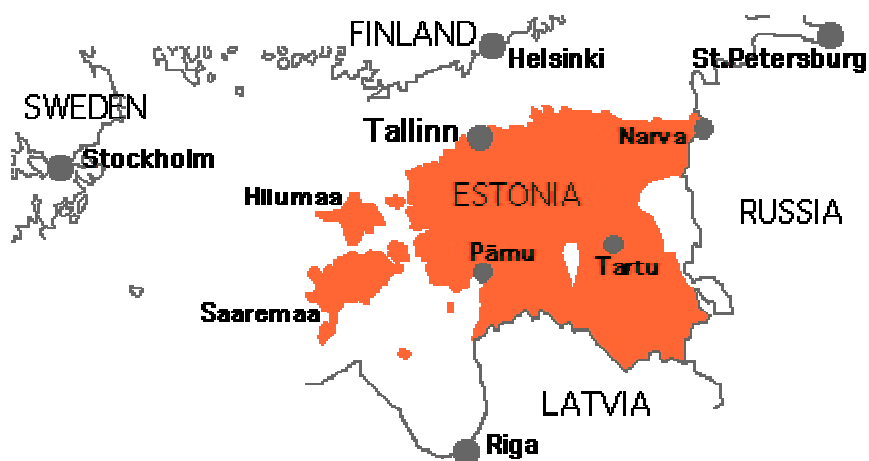
Figure 1. Location of Estonia

The beginning of the 20th century marks the start of research of tourism development and planning in Estonia at a national level. The first activity related to tourism was developing summer and health resorts carrying on the activity that had started in Tsar-Russia. Already in 1925 the Riigikogu passed a law on Summer and Health Resorts Suur,1939). Public Health Council was founded to organise the completion of that particular law.