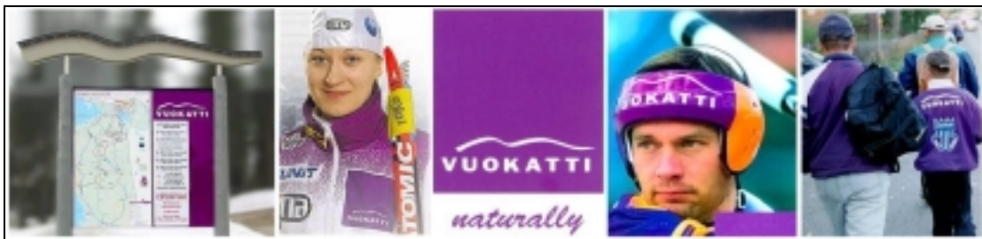
Figure 2: The New Vuokatti brand is used both in tourism and in sports.

The development of tourism and the construction of the image have taken place hand in hand. Some new resources available, for example from the EU programmes, have been utilised. The representatives of Sotkamo have secured that the strengths of Sotkamo are listed in the priorities of the Kainuu Regional plans, e.g. tourism, ski tourism, electronics, food manufacturing. Regional programmes have brought funding to several large projects of Sotkamo (such as the Ski Tube, Vuokatti Centre, Snowboard Tube). Before them several investments had been made in Vuokatti sport facilities (ice hockey hall etc). Focusing the efforts into the strengths has resulted that the municipality has not been eager to put resources into rural development and "small" village development projects, or cultural projects. This has created critical attitudes among these groups.