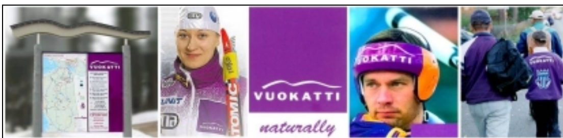
Figure 2: The New Vuokatti brand is used both in tourism and in sports.

The development of tourism and the construction of the image have taken place hand in hand. Some new resources available, for example from the EU programmes, have been utilised. The representatives of Sotkamo have secured that the strengths of Sotkamo are listed in the priorities of the Kainuu Regional plans, e.g. tourism, ski tourism, electronics, food manufacturing. Regional programmes have brought funding to several large projects of Sotkamo (such as the Ski Tube, Vuokatti Centre, Snowboard Tube). Before them several investments had been made in Vuokatti sport facilities (ice hockey hall etc). Focusing the efforts into the strengths has resulted that the municipality has not been eager to put resources into rural development and "small" village development projects, or cultural projects. This has created critical attitudes among these groups.