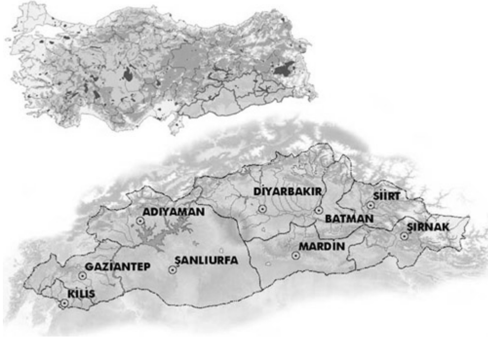
Map1. Location of Southeastern Anatolia Region and Sanliurfa - Harran (gap.gov.tr)

very few in the whole world and it should be preserved. The social effects of the rapid transformation that it goes through are worth attention.