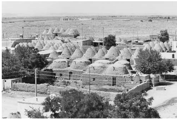
Photo 2 . Traditional Harran Houses

The Municipality and the Governorship bearing responsibility for the development of the district with sensitivity could not achieve any development for establishing a balance between “living-preserving” despite all their efforts to develop living conditions and to establish the infrastructure.