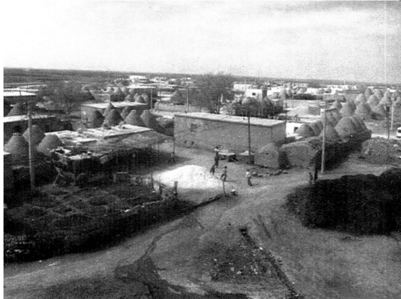
Photo 3 . Harran and Its Environs

There is an increasing need for residences and buildings in Harran within the framework of the current developments. However, despite this request of development, the area reserved for urban development in the district is quite limited. Besides the residential areas with typical Harran houses, the regions registered as “urban and archeological site area” are also among the major limiting factors. On the other hand, productive land that is the basis of the economy of Harran based on agriculture is also another important factor limiting the area of development.