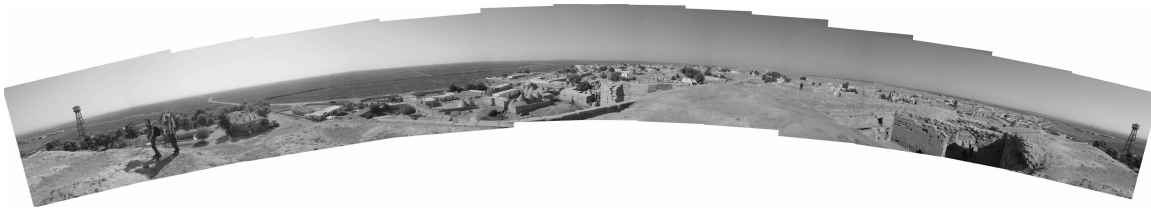
Photo1. General View of Harran

Although Harran is a settlement with a small scale, it is quite significant within the scope of socioeconomic development process. Harran, preferred by communities belonging to different religions and cultures for settlement and development is a place bearing the traces of many civilizations. Today it faces a new mode of action with the starting of settled life once again and as a consequence of the economic liveliness ( yerelgundem21.org ).