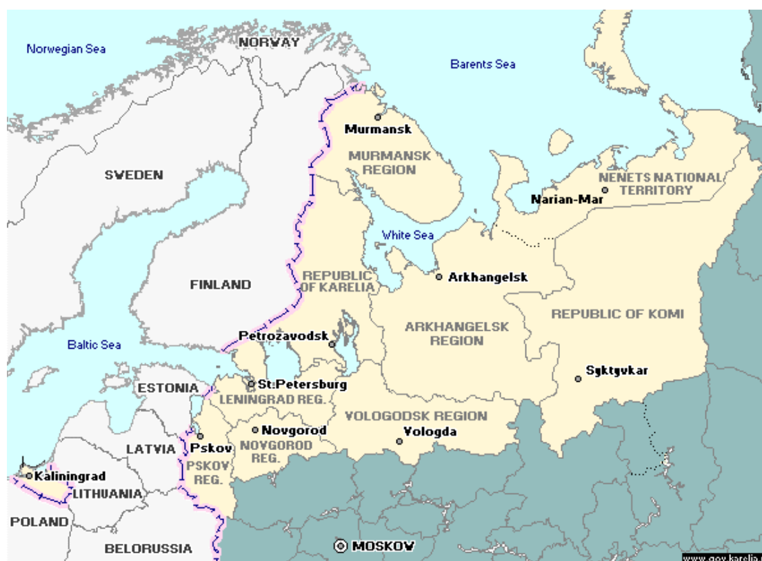
Map 1. Northwest Federal District of Russia

In doing so the paper seeks to challenge the ideology of Russia's integration with the EU. 8 The paper shows that the situation is more complicated. The strategic interests of Russia and the Union do not coincide. The most fundamental difference stems from their different choices between economic development and identity. It seems, European countries are ready to sacrifice their identities for the sake of the development and the mythological 'Europeanness', whereas for Russia its traditional identity has always been more important than material well-being. At present Russia rediscovers its roots, and this difficult process bears new tensions and divisions within the Russian society. This partially explains Russia's seemingly 'irrational' behaviour and failures in building a 'normal' democratic capitalist state. Both Vyborg and Sortavala are good examples in this respect.