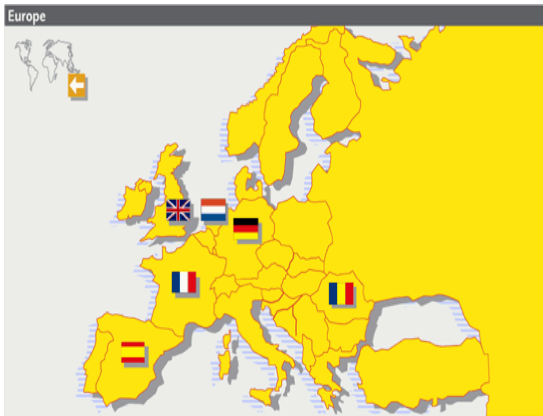
Map 1. Plants of EADS in Europe.