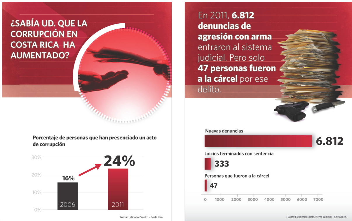
Figure 2. The Two Treatments, Corruption and Judicial Inefficiency