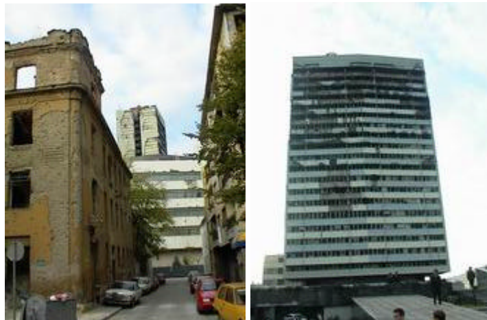
Figure 3: Destroyed and damaged seats of Government and Governance in Bosnia and Herzegovina. Government Buildings in Sarajevo 2000.

The breakdown of interethnic trust refers to the problems we have pointed out before at, and results in dysfunctional governance at various stages and levels. Literature on governance points at specific characteristics to which good, modern and effective (we can call it ' sustainable ' here) socio-political governance must adhere and subscribe to. Globalization, European integration, economic, technological, and societal developments have a major influence on public policies and governmental performance (Kooiman, 1993; Rhodes, 1997; Van Heffen and Kickert, 2000). In order for post-conflict zones to reach a level of what we could call here a complex-dynamic and modern-diverse governance 'CD-MD' Governance (one which can cope with all dynamics and changes in modern society), they need to fulfill the requisites for a 'good