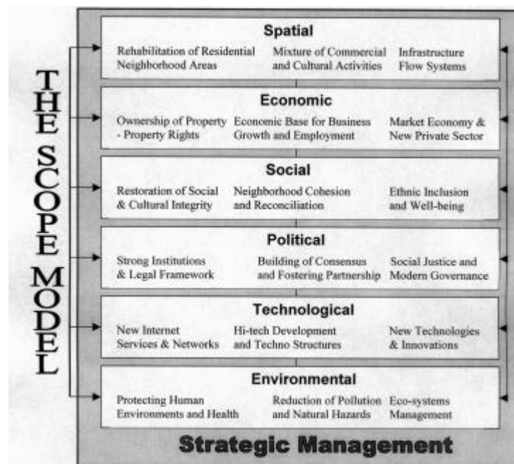
Figure 2: The SCOPE Conceptual Working Model

In developing such a conceptual working model we pose the following general questions: Which phases should we have and are they equally important? Will they be inter-linked? Should all of them be considered in the context of post-conflict zones? Can we achieve the idea of sustainable reconstruction in communities by only focusing on some of them? Are the structural points of the model applicable to the situation on the ground? What are the constraints, which will change from place to place? What can be done locally and what is transferable? Is it possible to engage the community and in what fashion, and so on.