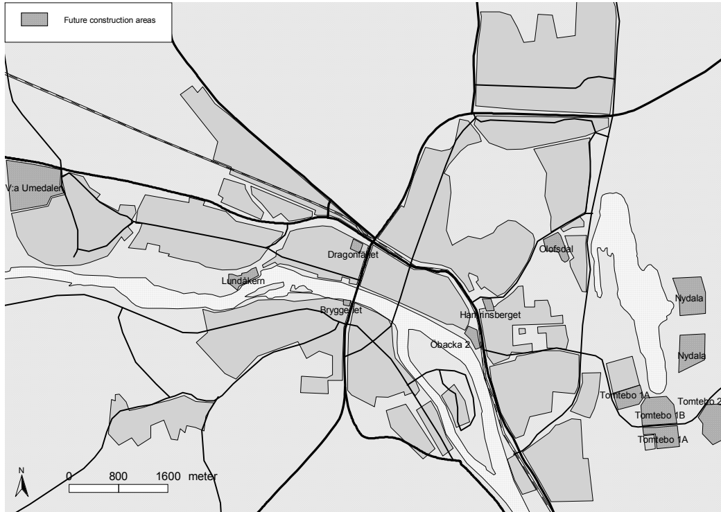
Future 4: Future construction areas

The parameter values from the regression with the weight matrix d_{1500} are used in the calculations. To be able to compare different locations we consider a hypothetical co-operative flat. We assume a 70 \text{ m}^2 flat with a monthly fee of 3 500 SEK. The area for each site is approximately as given in the figure. The turnover is assumed to be 20 percent and the population is set to three times the number of flats prepared to be built at each site[35]. The number of single family houses are assumed to be 0.6/1\ 000 \text{ m}^2 . This gives the prices per square meter indicated in Table 6.