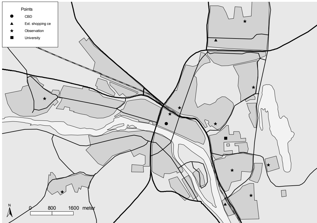
Figure 1: The Umeå City Map 1999

map in Figure 1 below and indicated by stars. Two major housing firms in Umeå, HSB and Riksbyggen, have provided the data on the individual flats and their location at street level.