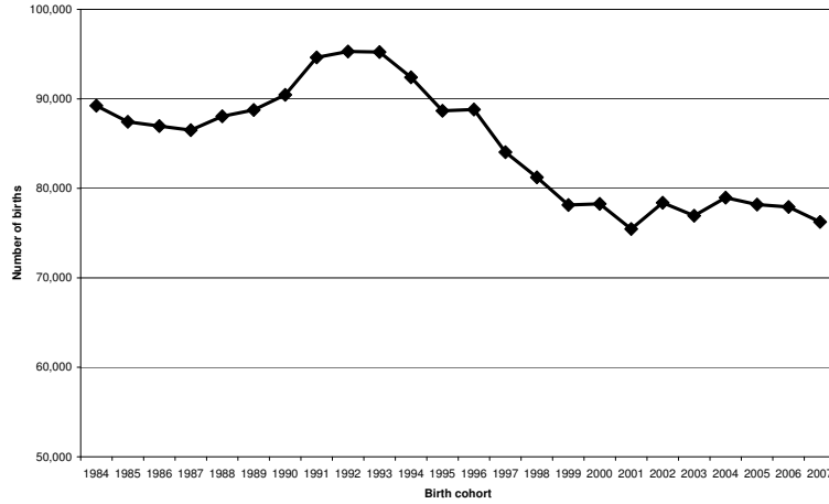
Figure 1: Number of births per year

As Figure 1 shows, fertility in Austria has declined over time. Since the 1980s, the number of annual births has gone down from roughly 90,000 births per year to less than 80,000. Only at the beginning of the 1990s did fertility slightly increase, most probably as a reaction to the extension of the maternal leave duration in 1990. This development was followed by an even sharper decline in fertility in the late 1990s. However, in the 2000s, the rate of decline slowed down significantly. At the same time, the fraction of children born out of wedlock has increased from less than 10 percent in 1984 to 38 percent of births in 2007 (see Figure 2).