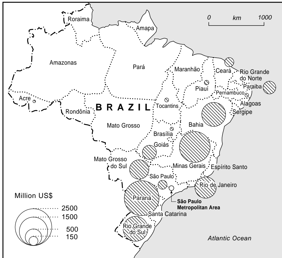
Figure 2 Territorial distribution of the planned FDI in new automobile plants (1996-2001), by state.

North East and Centre. Other, mainly Asian, companies intend to develop investments outside the South, but the future of most announced investments is still uncertain. Overall the North, North East, and the Centre West regions -with the exception of the state of Bahia, which has recently emerged as a strong player and is likely to attract 8.8% of the total investment in the sector (MICT, 1997)- still lag behind in terms of FDI (Figure 2).