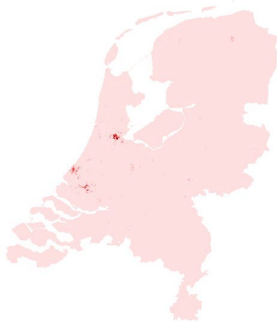
Figure 2 Distribution of multi family dwellings in 1980 (number of dwellings per square of 500 x 500 meters)

The current policy is distinctly different from the preceding period of clustered de-concentration in which new towns like Almere and Hoorn were created. However, we