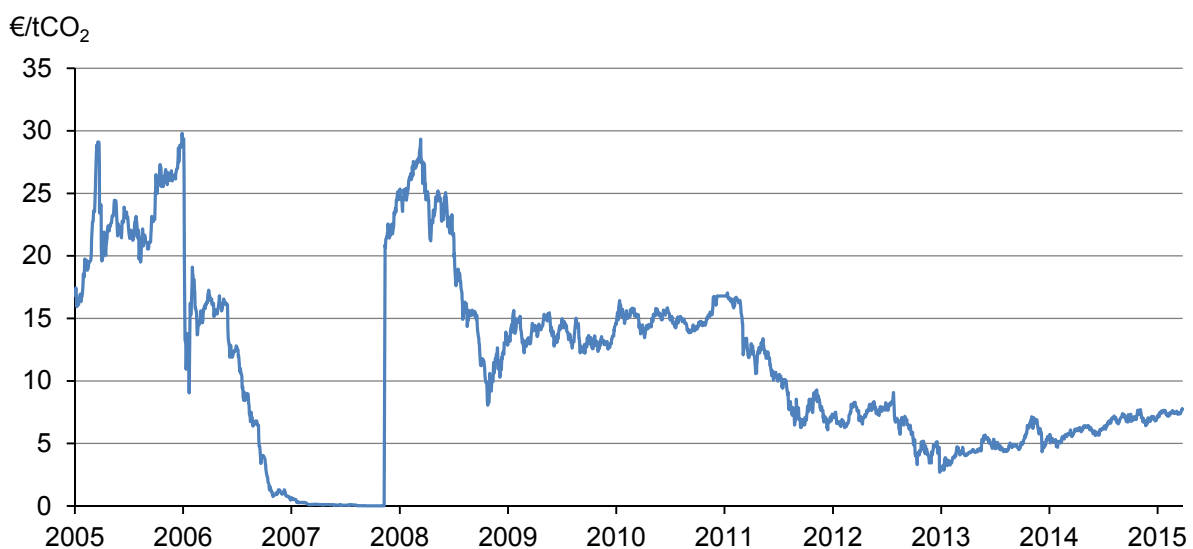
Figure 2: EU ETS Future Prices

Source: Thomson Reuters Datastream. [Online]. (Accessed: July 2015). ICE-ECX EUA CONTINUOUS - SETT. PRICE - E /TE, LEXCS0.