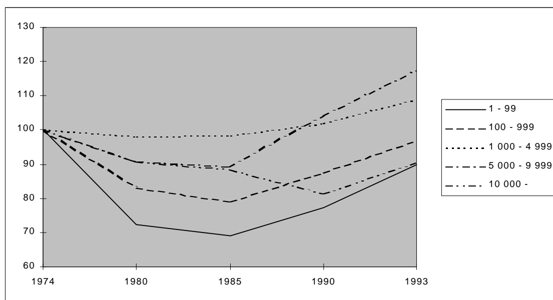
Figure 2. The averages of the Herfindahl index in regions categorised by the number of persons employed in manufacturing in Finland in 1974-1993, 1974 = 100.

category at the end of the 1970s. In particular, the industrial structure of the smallest LMDs diversified, signifying that the rural industrialisation at the end of 1970s did not rest on specialisation. Considering the former one-sidedness of these regions, this is not a surprise. However, the diversification of the industrial structure characterises the development in other size categories as well. This can be explained by the considerable industrial restructuring. Although there was no marked change in the Gini value depicting the industrial structure of the national economy, the industrial renewal is confirmed by the employment changes of the 80 manufacturing industries averaging more than 20 percent from 1974 to 1980. During the first half of the 1980s the trend towards a more diverse production structure continued apart from category iii. However, during the second half of the 1980s the trend showed increasing specialisation in all categories except in the group of the biggest LMDs. Eventually, at the beginning of the 1990s the trend was definitely clear. In addition to the Herfindahl index, the turn towards increased industrial specialisation is indicated by the development of the average values of the Theil measure calculated for all regions (1974: 0.161; 1980: 0.150; 1985: 0.157; 1990: 0.164; 1993: 0.182).