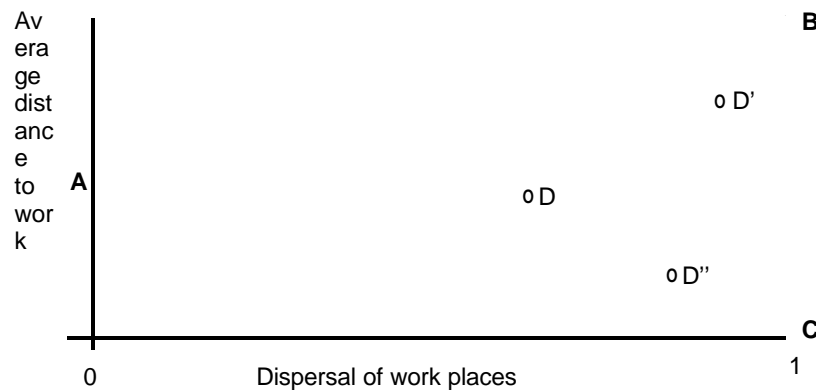
Figure 3: The urban triangle (cf figure 1). D in the figure denotes a fictive city of today. D' denotes the IT-telework scenario. D'' denotes the IT-node scenario.

Figure 3 is another way of presenting the differences between the two possible developments.