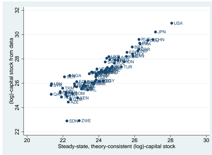
Figure 1: Theory-Consistent vs. Actual Capital Stocks