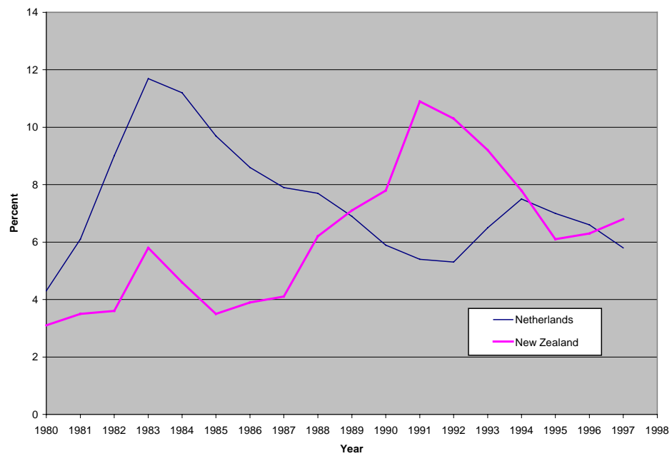
Figure 2: Unemployment in The Netherlands and New Zealand, 1980-1997