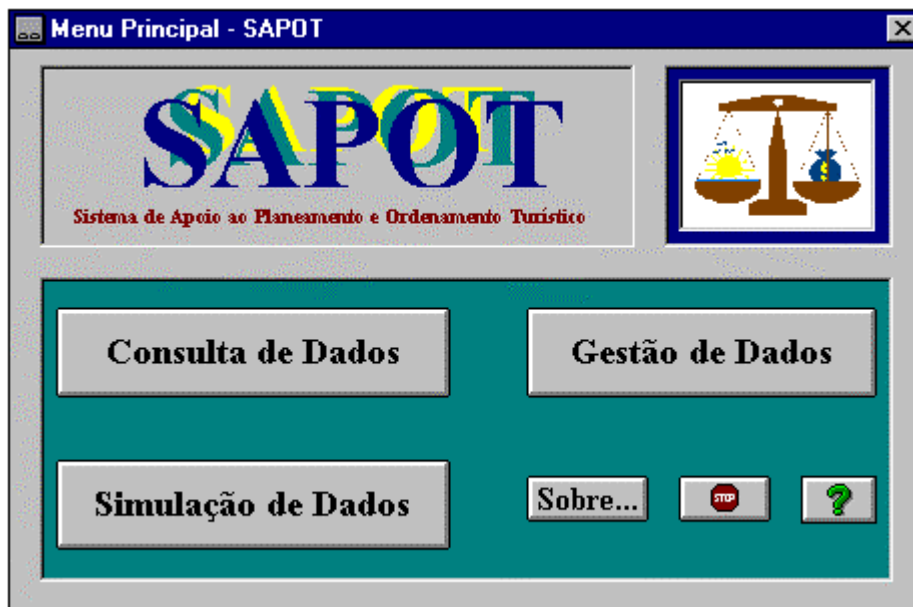
Figure 4 – Main Menu Form

The HMI composed by the behaviour redirect forms simplifies the selection of a specific behaviour to the program that is described by the State Transition Diagram. An example of this kind of form is that represents the “Main Menu” (vid. Figure 4).