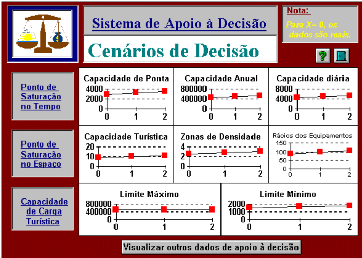
Figure 6 – Consult of the decision schemes