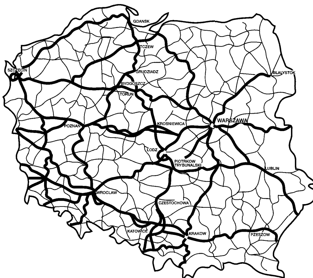
Fig.1 The Existing Road System in Poland