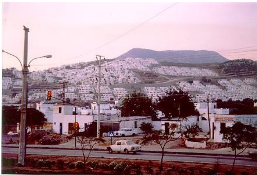
Figure 2: Up: Bodrum in 1950