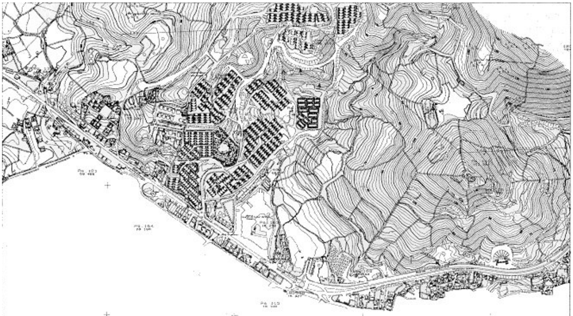
Figure 1: Up: The land use map of Bodrum in 1988 Down: The land use map of Bodrum in 1996