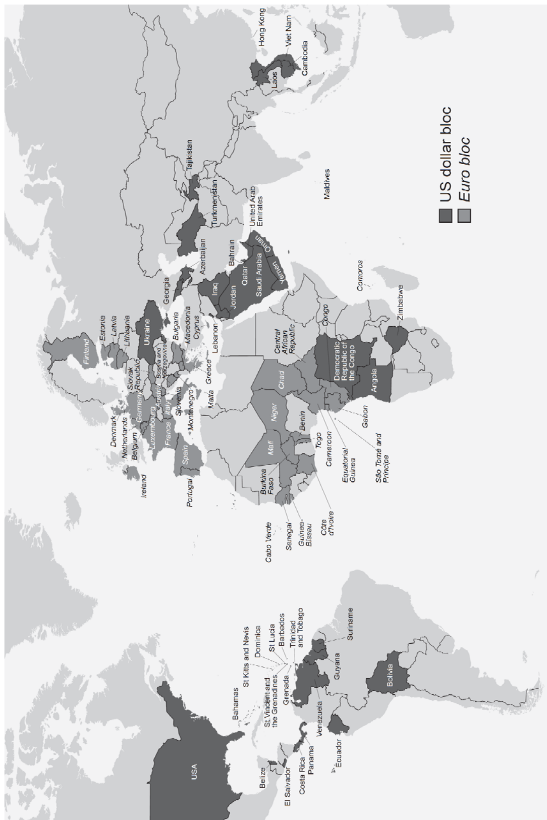
Figure 1: Map of the two major currency blocs in 2012

Note: The map shows those countries and territories of each of the two currency blocs which are included in the sample.