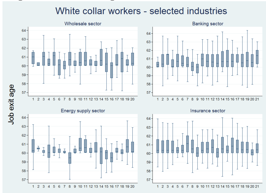
Figure 2: Job exit age of male white-collar workers a

a Own calculations based on data from ASSD . Job exit age distribution of largest firms in selected sectors for white-collar workers