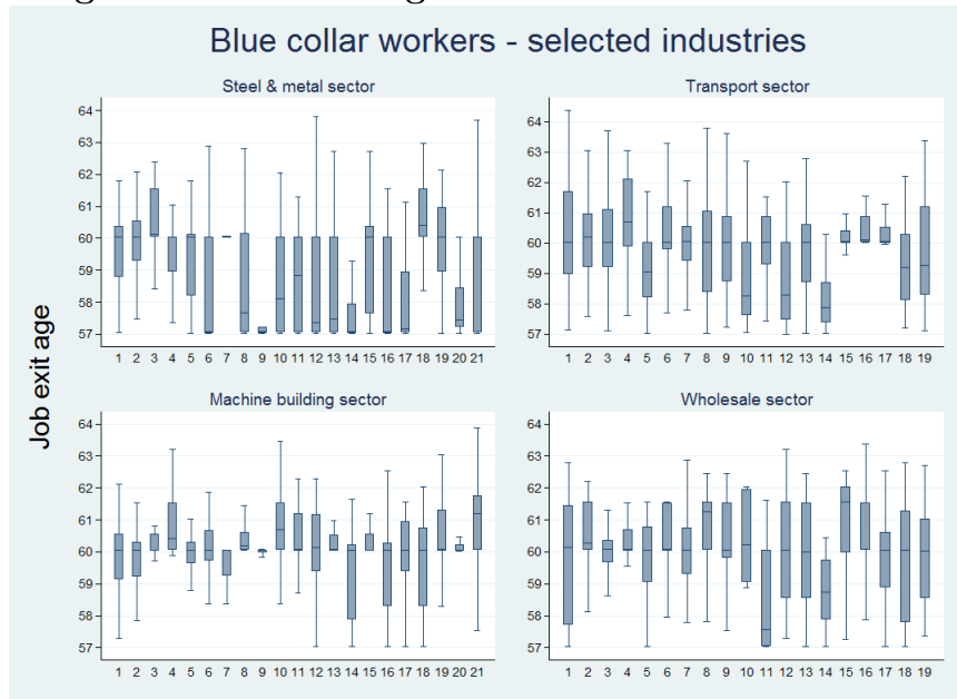
Figure 1: Job exit age of male blue-collar workers a

a Own calculations based on data from ASSD . Job exit age distribution of largest firms in selected sectors for blue-collar workers